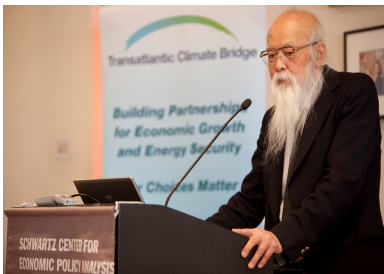
Economist Hirofumi Uzawa, professor emeritus of Tokyo University, delivers the keynote address at the Economics of Climate Change conference.

Participants addressed the economic issues associated with carbon emission, climate change, and emission regulation and shared important lessons on how to enact effective climate change policy in light of the United States' fragile economy and the post-Copenhagen tensions between developed and developing countries.